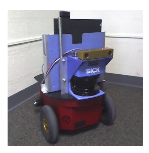
Figure 3: A Pioneer P3-AT on which the planner integration was verified.

ronments using local closed world (LCW) information produced by sensing actions (Etzioni, Golden, and Weld 1997).