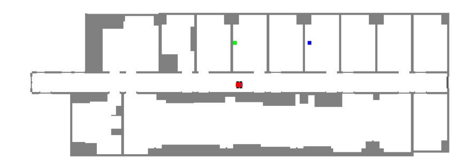
Figure 2: A map of a sample search and report scenario; boxes in rooms are stand-ins for humans, where green (at left) indicates injured and blue (at right) indicates normal.

mitments (Cushing, Benton, and Kambhampati 2008). Nevertheless, such methods ignore the fact that many changes are localized to a certain portion of the domain and may not require the (often expensive) re-computation of a new plan.